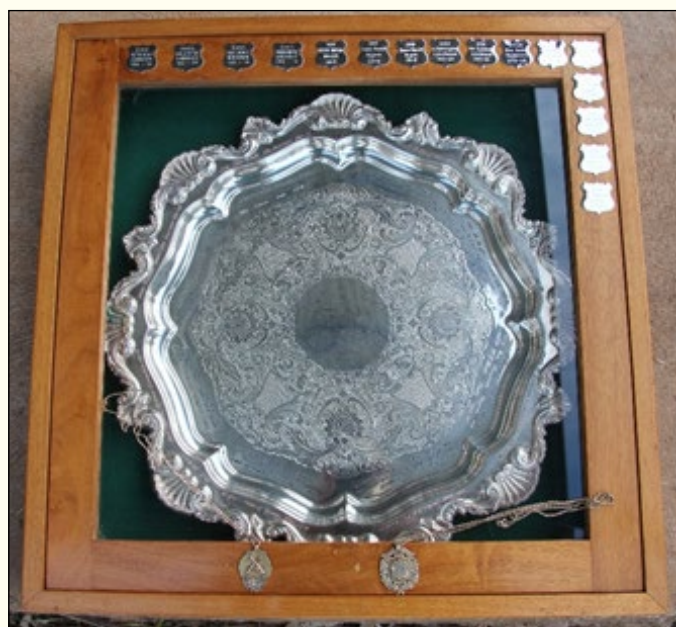
The Jubilee Shield that has been won in the past by many of Australia's top marksmen and women

from all over including Wodonga, Hornsby, Canberra, Nowra, Goulburn, Katoomba, Lyndhurst and Eugowra.