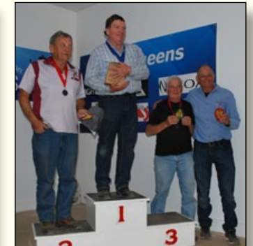
Target Rifle C Grade