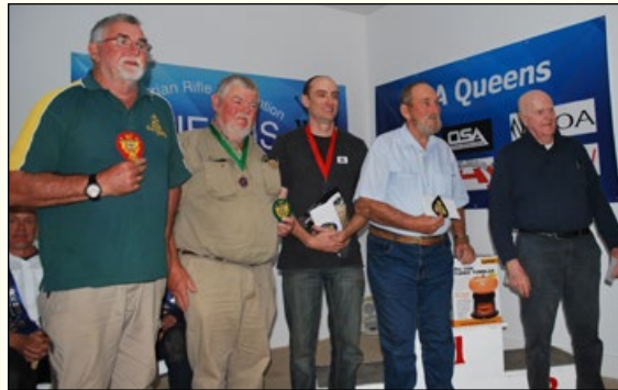
F Class Standard B Grade