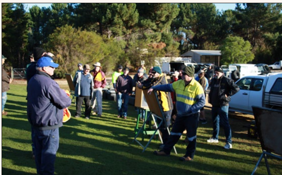
A cold start to a sunny day