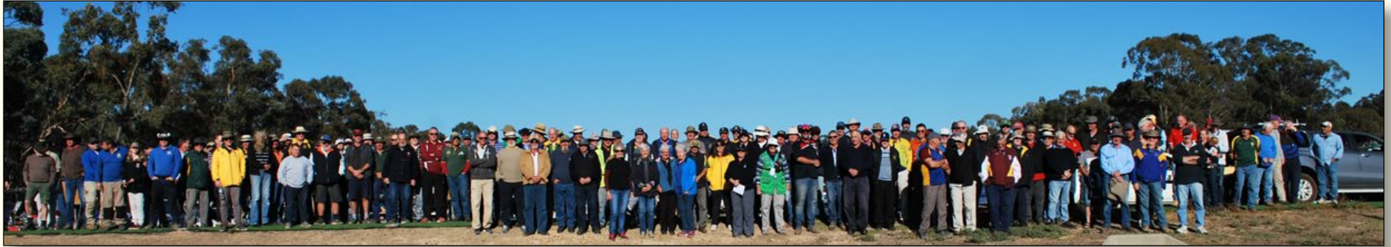
All group photo from Queens Day 1