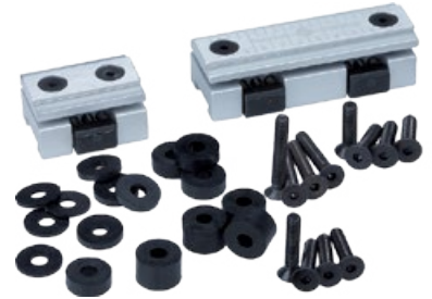
844 multi-height sight base set