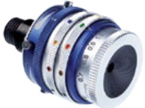
568MC rearsight iris, 48-colour and polarisation filter set