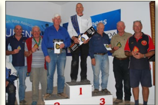
F Class Standard A Grade