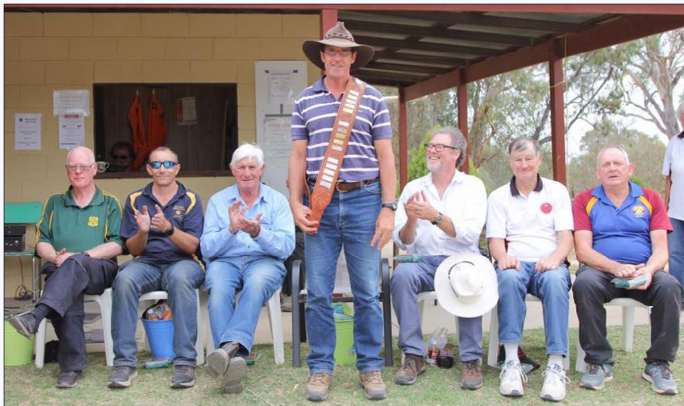
Winners WRC OPM