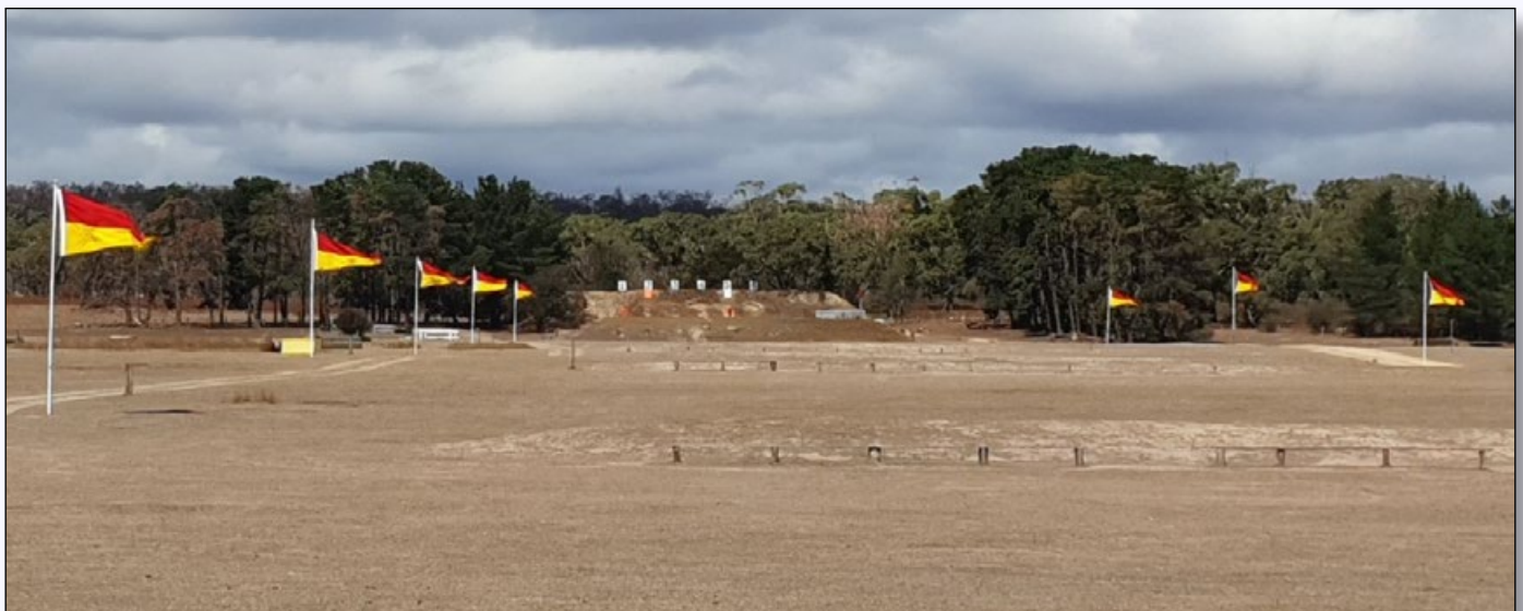
Not enough rain but plenty of wind