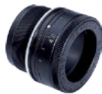
520 iris foresight