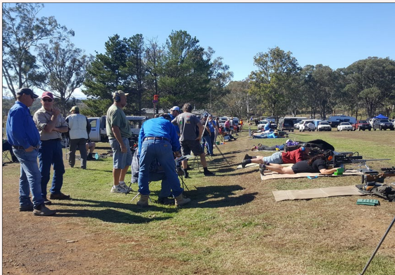
Shooters travelled from all over to compete