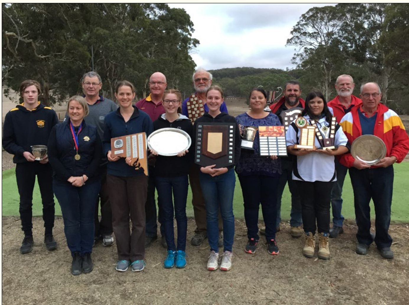
Happy winners on the Fathers and Sons match day