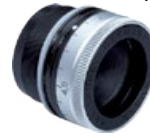
522-S iris foresight