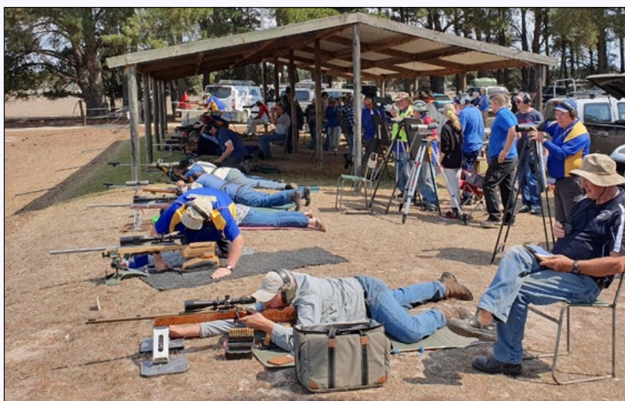
Concentration on the 1000 yard mound