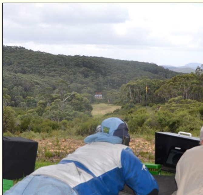
Looking down range

Thanks are expressed to the Horsley Park Gun Shop for their generous support of this meeting.