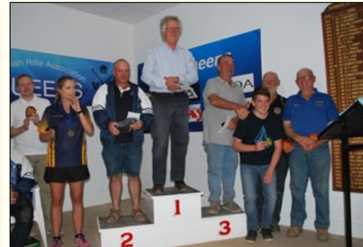
Target Rifle B Grade