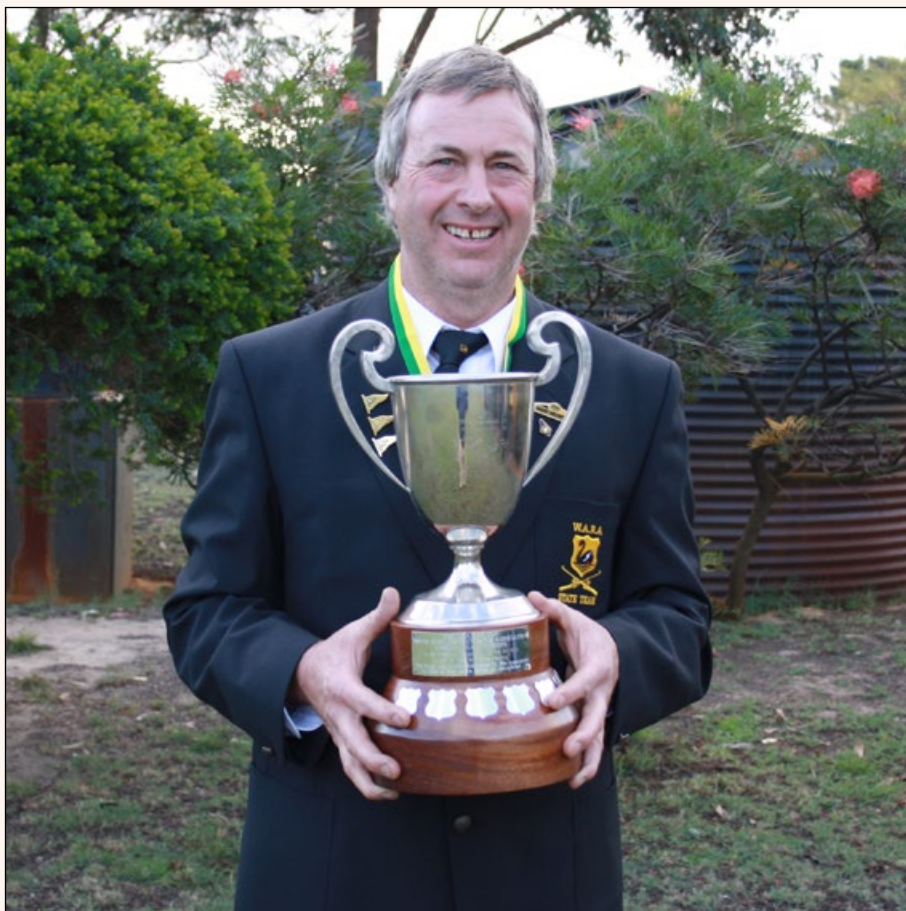
Winner of Coolilup Cup Target Rifle