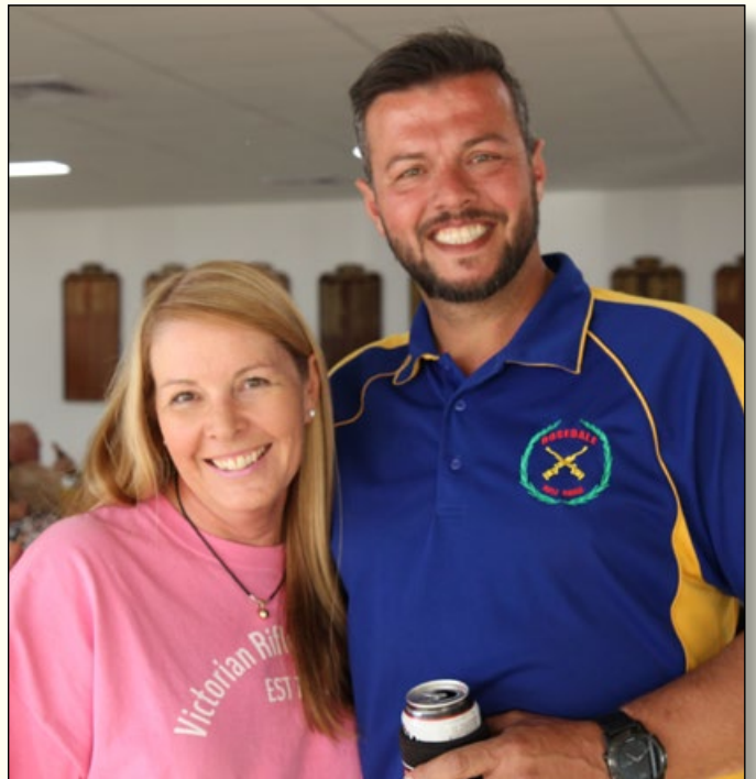
The VRA Exec Officer and VRA Treasurer