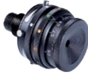
565 rearsight iris, 6-colour filter, two polarisation filters