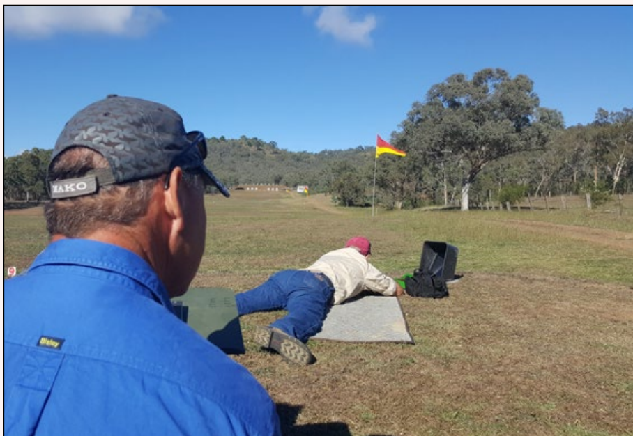
Sunny conditions on the range