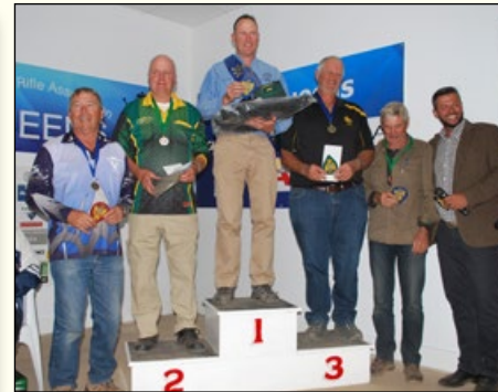
F Class Open