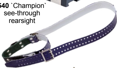
437 'pulse-free' sling