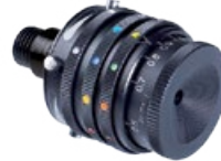
568 rearsight iris, 12-colour filter, two polarisation filters