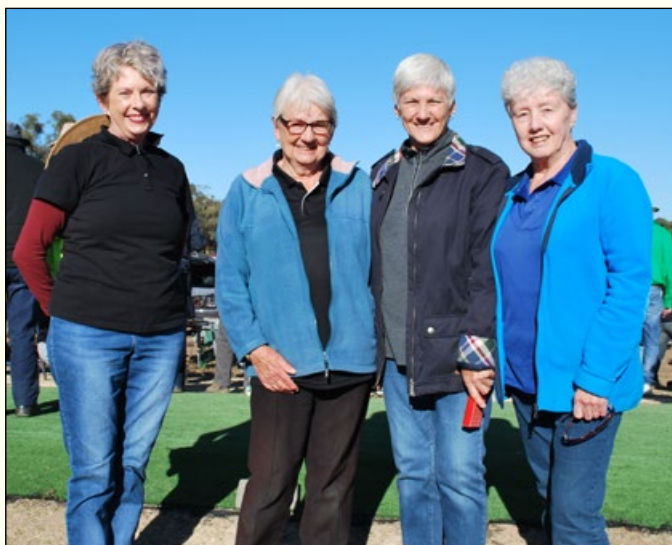
The Ladies on Queens Day 1