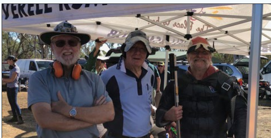
Wise men prepare for 600 yards on day one