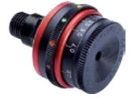
566-R rearsight iris, 6-colour filter