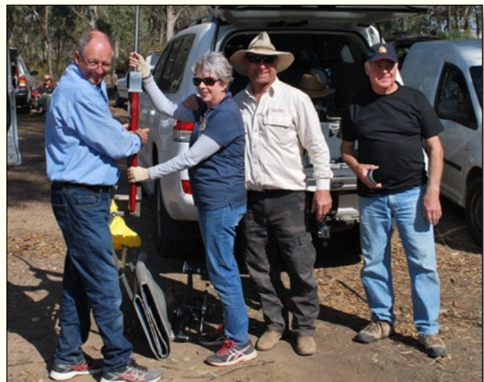
The crew from Claremont Rifle Club