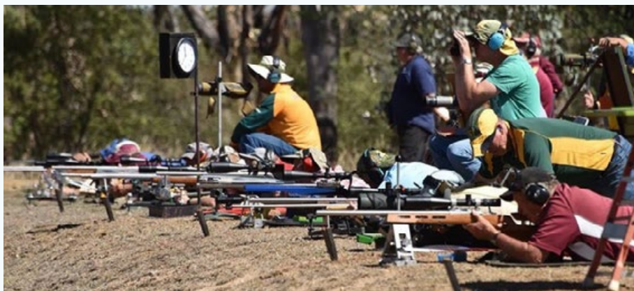
Competitors on the 500 yard mound day one

The final stage of the day from the 300-yard mound saw the 'four most