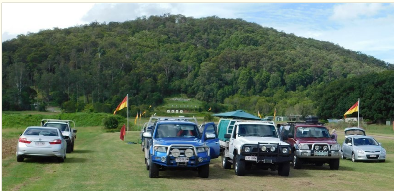
Range view at 500 yards