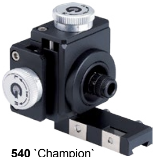
540 'Champion' see-through rearsight