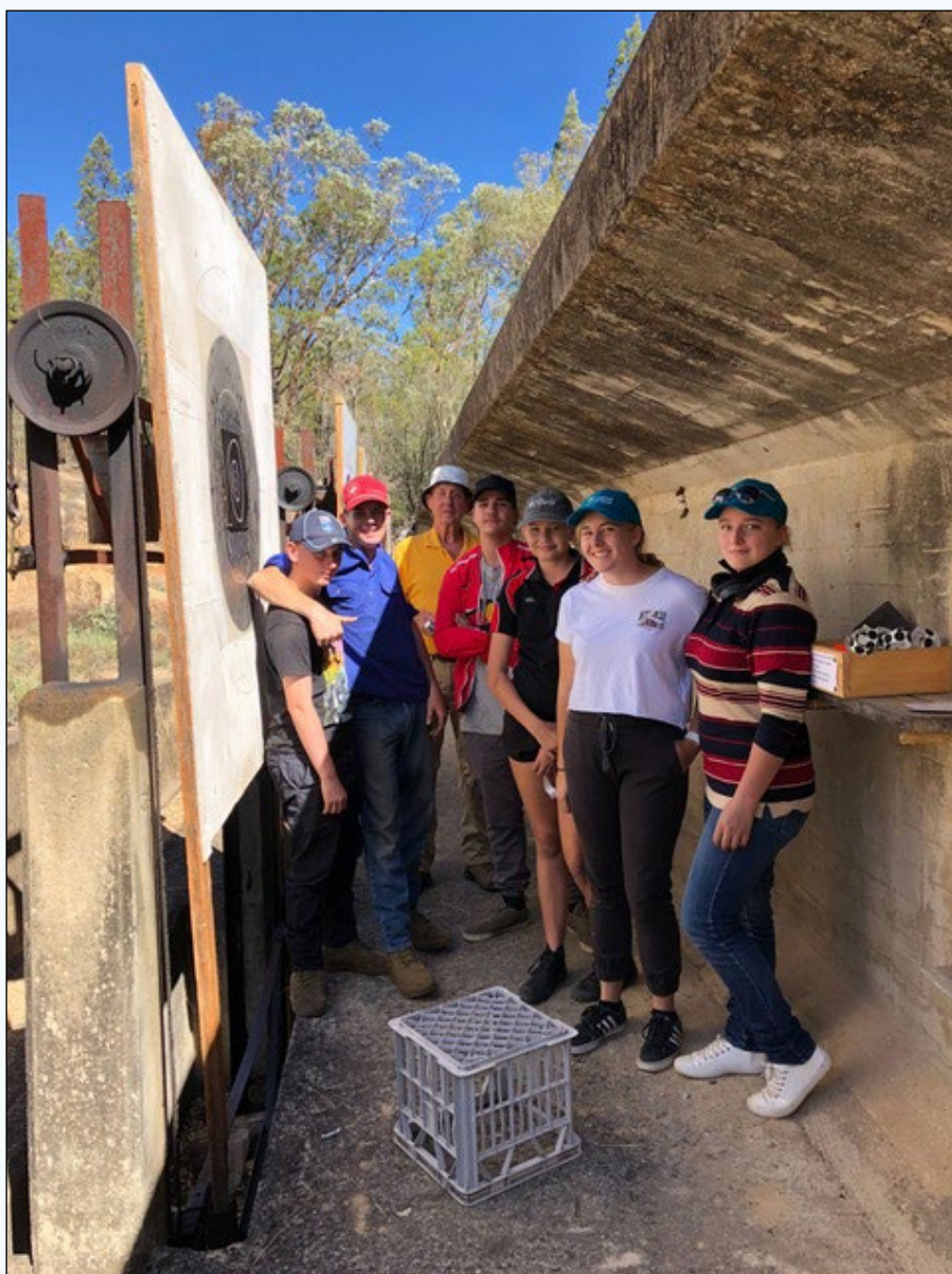
A fantastic group of markers