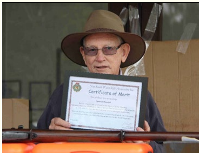
A happy face on the day of shooting