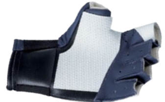
466 half-cover glove