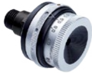
566-S rearsight iris, 6-colour filter