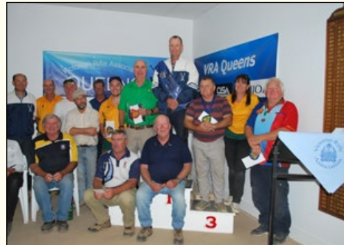
Target Rifle A Grade