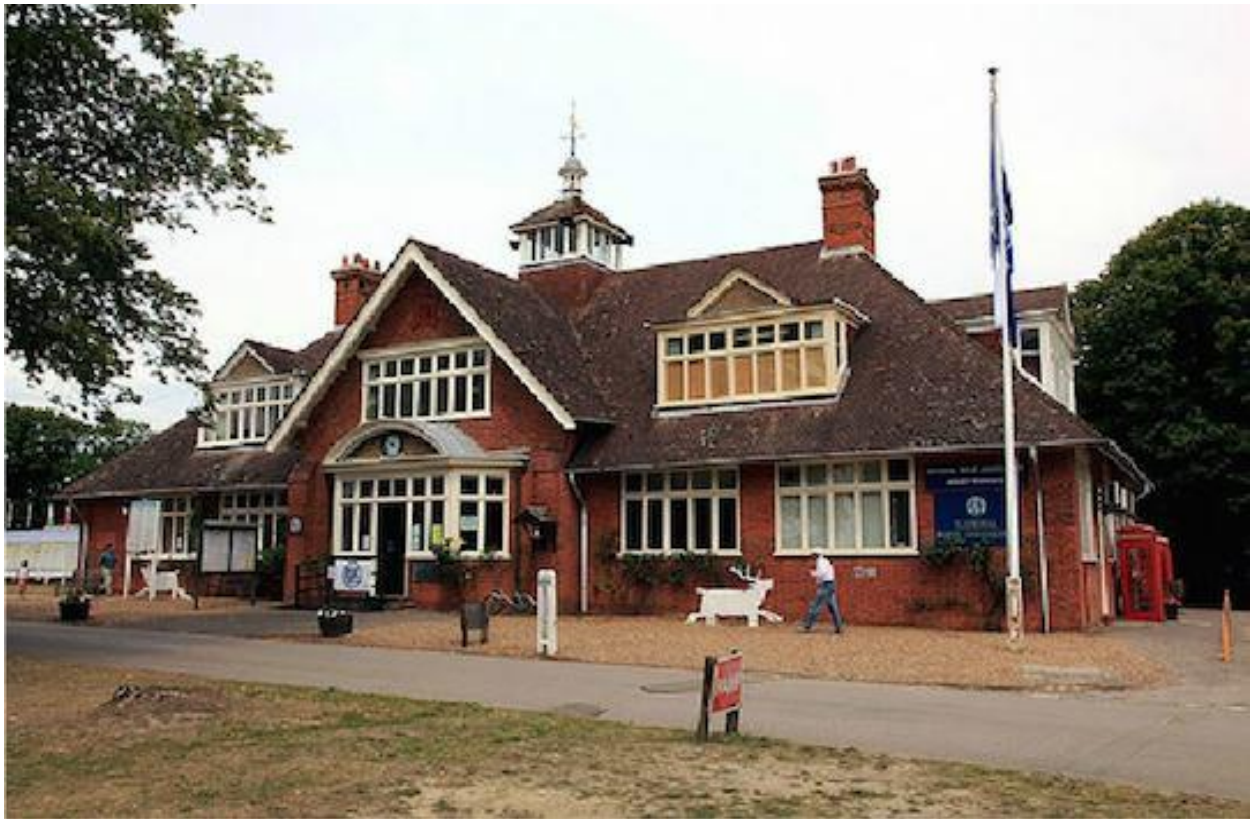
NRA of GB Headquarters